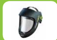
Clearmaxx Std. Helmet