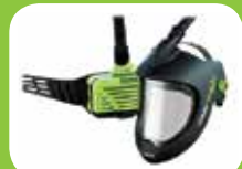
Clearmaxx with PAPR system